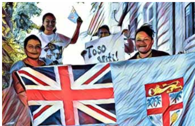
Staff and a friend of CCF pose with our noble banner blue. Illustration: Gregory Ravoia Indigenous people and the Rights of the Minority Groups have recognition.

Ethnic division and racial discrimination in Fiji lies on the will of our national leaders and government to address it. It will be always an issue if leaders are not genuine in addressing racial discrimination. Worse still, if leaders come up with reforms and policies under the façade of equality without consulting those that will be affected than racism will always emerge. Far too long, the issue of racism has been centred on I-Taukei and the Fijians of Indian descendants. Other minority groups such as those of Solomon descendants, Chinese descendants, Banabanas, and others are left out along with their needs and issues. It is therefore critical that when we talk about elimination of racial discrimination and promoting equality, we have to ensure that the Rights of the