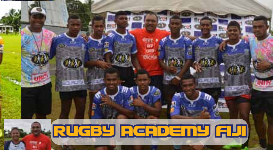
RUGBY ACADEMY FIJI