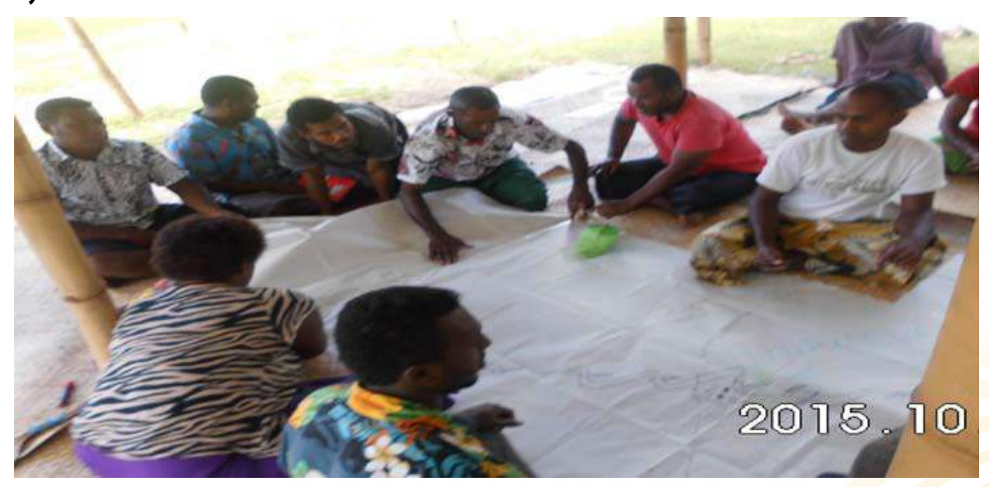
Participants from Lekutulevu during the CDP training.

Community Action Plan training had an immense positive impact in communities that were identified by CCF in partnership with the Fiji Community Development Program. One such community is Lekutulevu village, Tikina Vaturova, Cakaudrove Province in Vanua Levu.