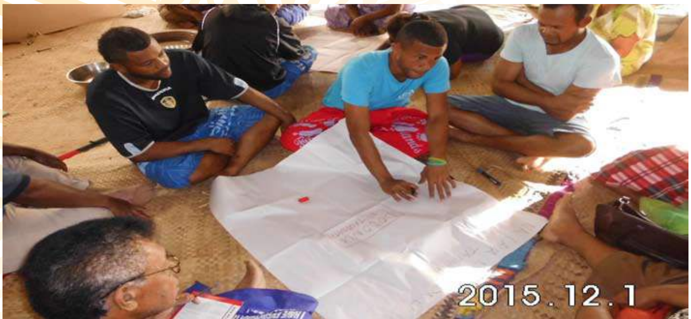
Participants from Korova during the workshop.

Residents of Korova settlement along the Laucala corridor in Suva received their first ever workshop from any organisation regarding ways to improve their standard of living.