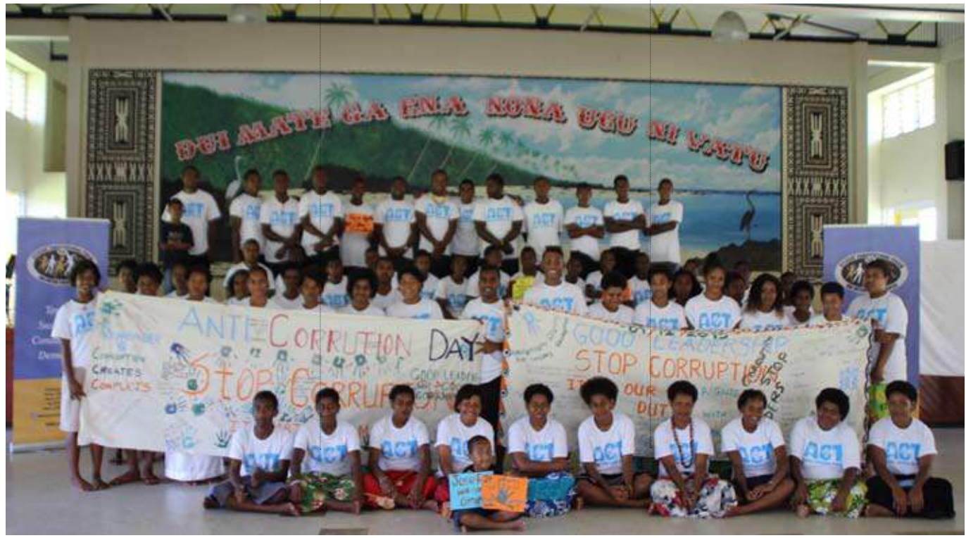
Youth participants during the International Anti-Corruption Day at Ratu Kadavulevu School in Tailevu.

Citizens' Constitutional Forum (CCF) was excited to contribute positively to the global commemoration of the International Anti-Corruption Day. Celebrated on 9<sup>th</sup> December 2015. The global theme was "Break the Corruption Chain".