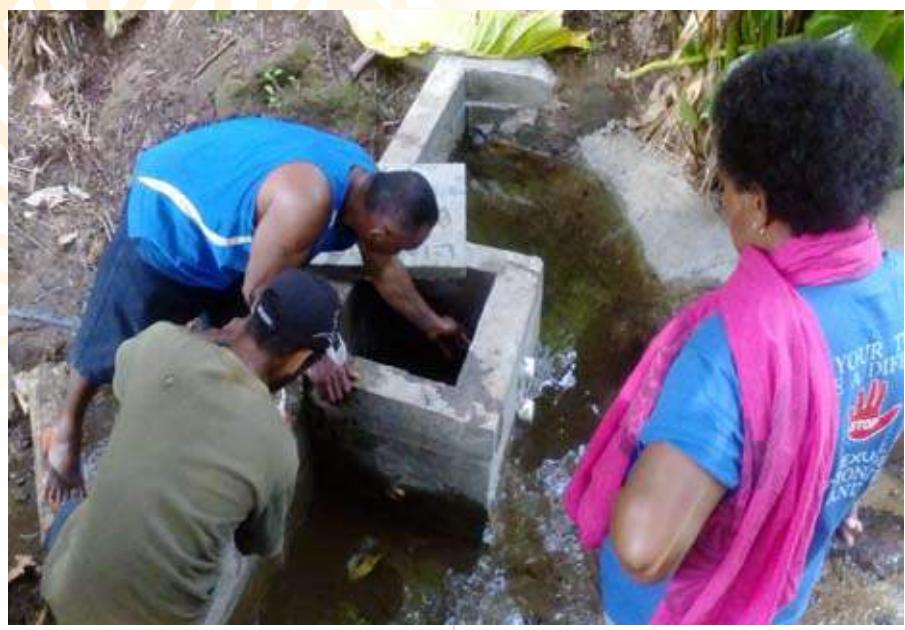
Residents of Welagi try out their new water project .

"When there is water shortage in the village, we would have to go to the river to get water. For the 17 years we have lived here, our toilet can now flush. With two families